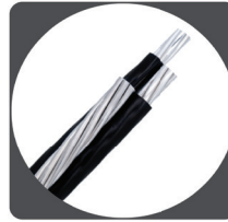
Service Drop Cables (Overhead)